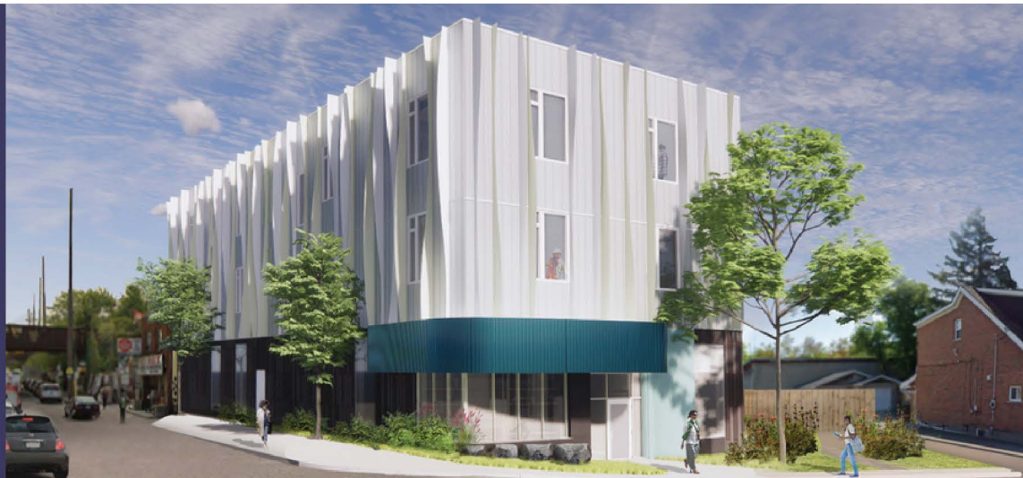
LGA Architectural Partners