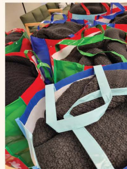
Orange Shirt Fundraiser