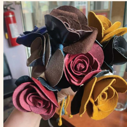
Mother's Day handmade everlasting roses