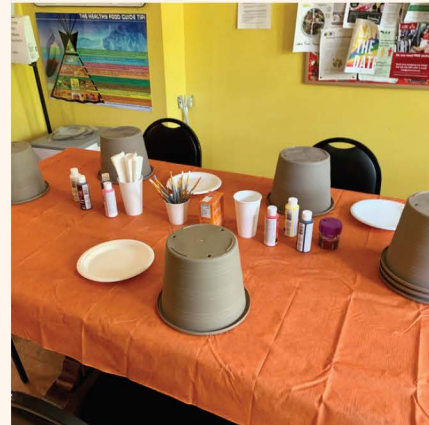
Program: painting and planting flower pots