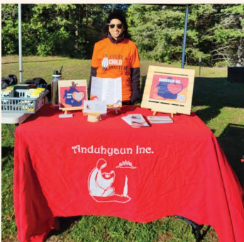
One Academy Trail Run