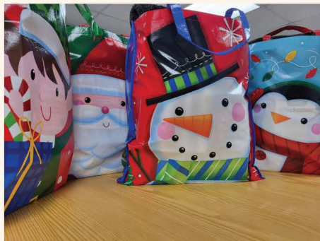
Winter Solstice donations